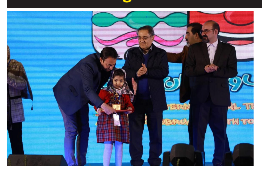
Iran Theater- The 28th Ardakan Theater Festival for Children and Young Adults has awarded its top prizes.

The closing ceremony of the 28th Ardakan Theater Festival for Children and Young Adults was held, Sunday, February 25.