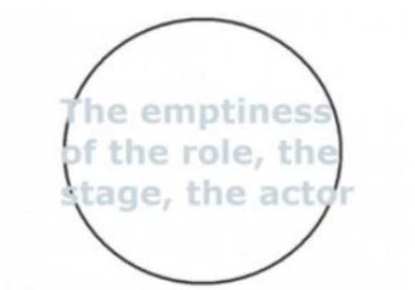
International Directors' and Trainers' Colloquium 2021

Please click on the title for more information.