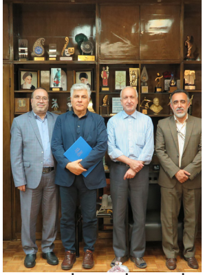
ten works and translation and consultation in educational and research projects.

This council is supposed to cooperate with the Office of Education, Research and Publications in the selection of writ-