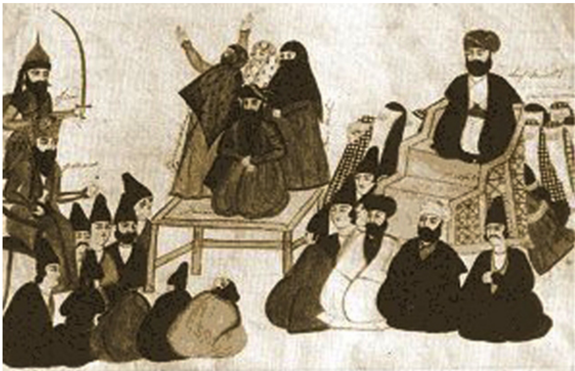
Historic picture of a ritual & traditional theatre form of Iran.