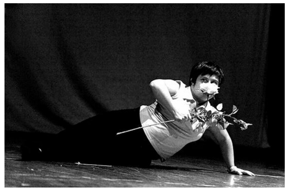
In forma di rosa.

Aenigma University Theater of the Carlo Bo University of Urbino receives the International 3.0 Inclusion Award at the University of Macerata