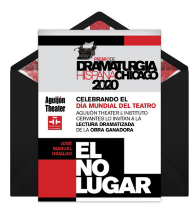
Let's Celebrate the Theatre!

Aguijón Theater Company and the Instituto Cervantes de Chicago invite you to celebrate World Theater Day!