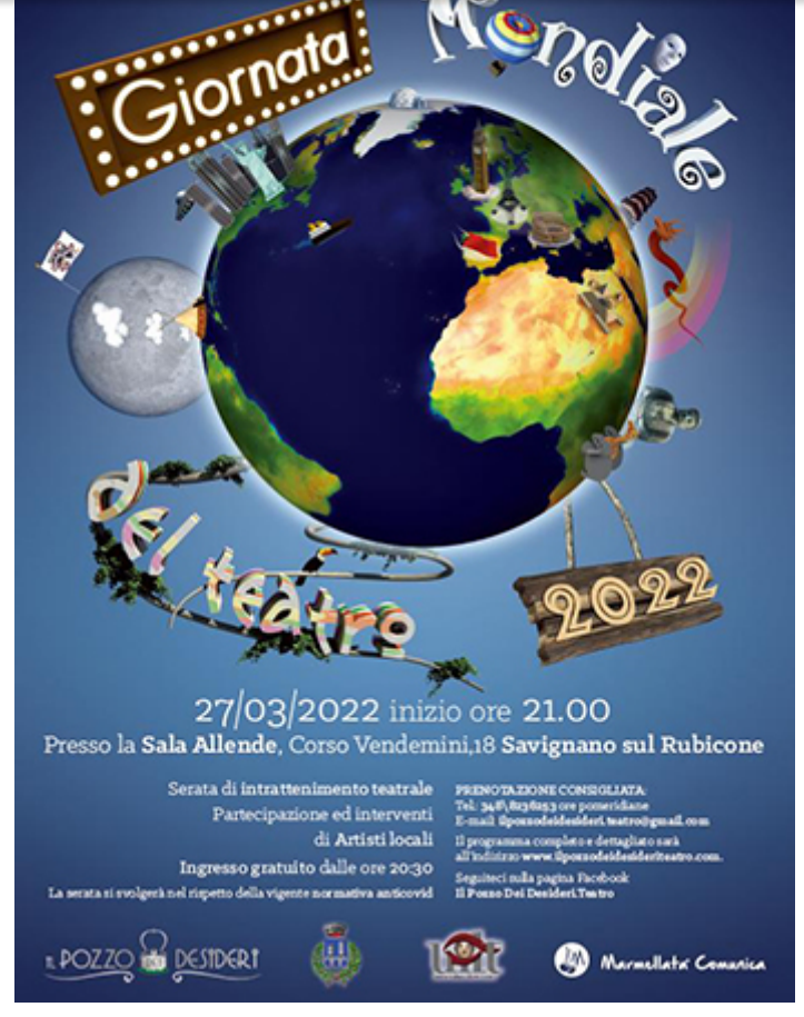
Sunday 27 March 2022 | 21h00 in Savignano sul Rubicone, Italy Venue: Sala Allende, Corso Vendemini18, Savignano sul Rubicone >>For more information, please click here.