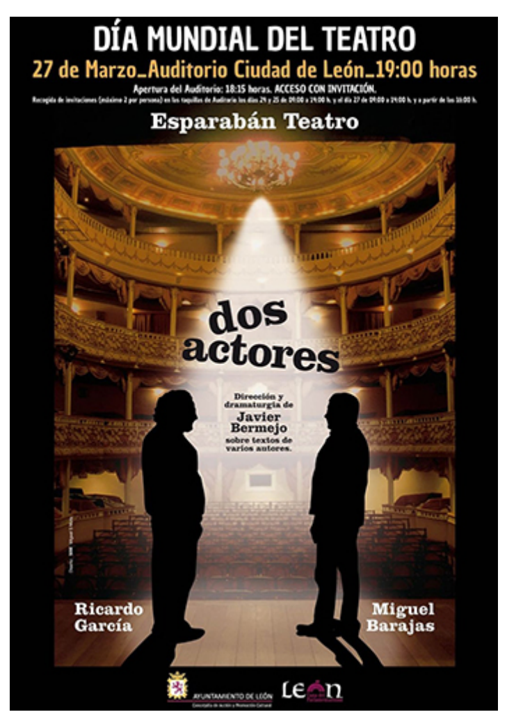
Sunday 27 March 2022 | 19h00 (Paris Time) Venue: Auditorium in Léon, Spain

World Theatre Day 2022 will be celebrated in Léon in Spain. The event consists of World Theatre Day 2022 Message Reading, and followed by performance of the play