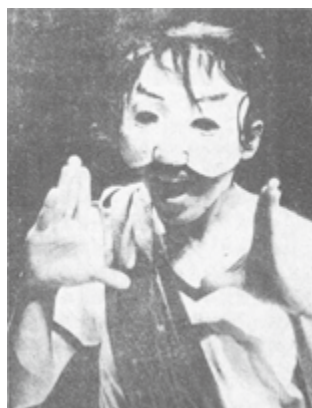
■ Questions for the Living , Central Experimental Drama Theater, 1985 version