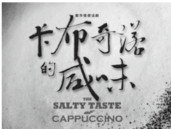
■ The poster of The Salty Taste of Cappuccino

The application of these symbols into the dram helped to form three different scenes. In the first scene, a woman's child died. Seeing this was like tasting a