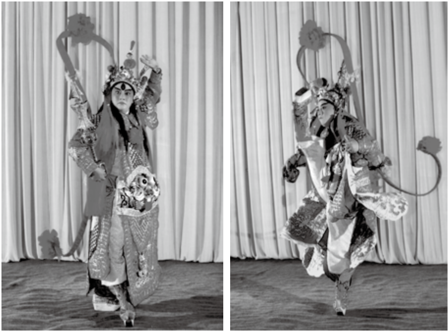
■ Chuanju Skill: Ti Huiyan