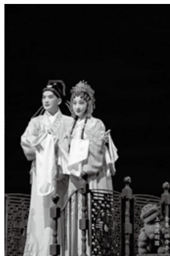
■ The Peony Pavilion