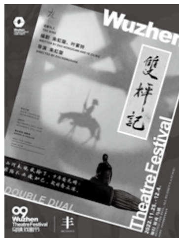
■ Double Dual , Wuzhen Theatre Festival poster

poet Du Fu and his poetic world, allowing the audience to witness the historical panorama of the middle and late Tang Dynasty. The dialogue in the play is a mix of classical and vernacular Chinese, and Feng Yuanzheng emphasizes that "the poetry in the play should be spoken, like a conversation, using poetry as a means of dialogue." This allows the audience to understand the dialogue while experiencing the classical charm and poetic rhythm of the work.