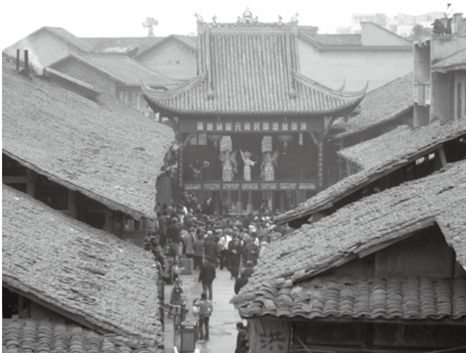
■ Ancient Xi Tai of Overpass Tower in Luocheng Town, Jianwei County, Sichuan.

Regarding the ancestral hall. Rural clan ancestral halls made-up a major feature of the ancient Sichuan countryside. After decades and hundreds of years of reproduction, the early immigrants from all over the country developed huge families. They established clan ancestral halls as important places for common worship of ancestors and discussion of family affairs. In the ancestral hall, there existed a Xi Lou, where the clan would raise money to hire a theatre troupe to perform at the clan gatherings and deliberations, annual festivals, birthday entertainment, weddings, and funerals.