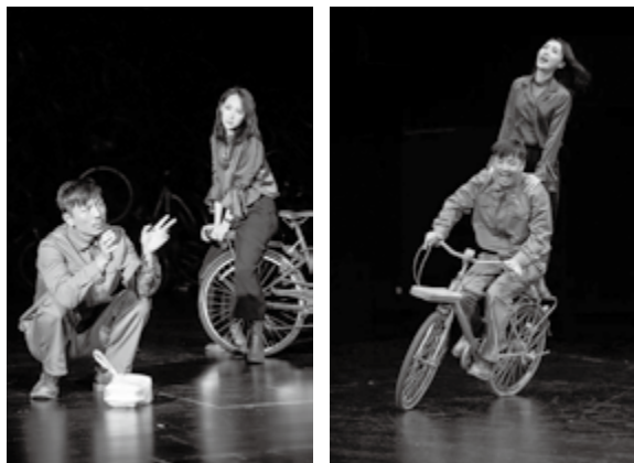
■ The Insane Asylum is Next Door to Heaven