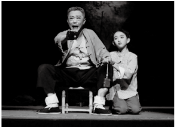
■ Chuanju Troupe of Sichuan Province restaged Face-Changing

When it came to the formal performance, it was no surprise that the play caused a significant response. The revised drama has multiple climaxes,