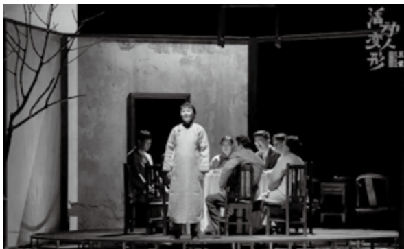
■ The Person of Activity Fluctuate