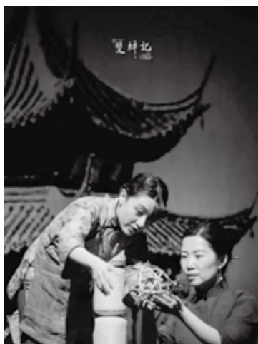
■ Stage photo of Double Dual