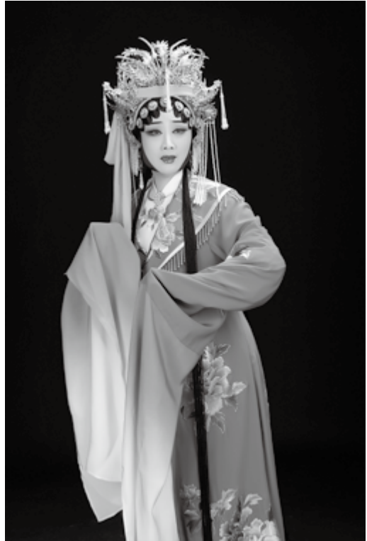
■ Chen Qiaoru, a two-time Plum Blossom Award winner, portrays the role of the Empress in Chuanju The Flower Falling and the Water Drifting .

If we want to explore the common characteristics of these outstanding playwrights, it would be that they have been immersed in the troupes for