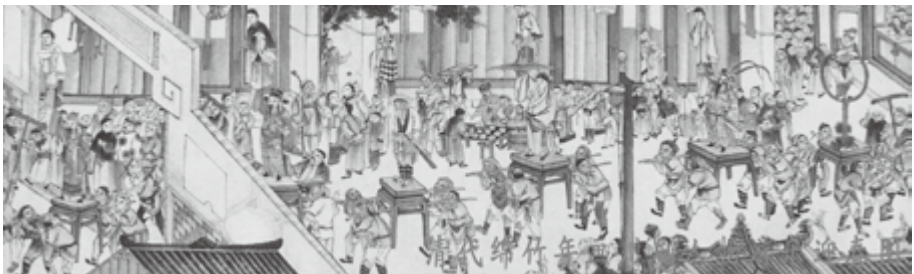
■ Mianzhu New Year Painting of Qing Dynasty : Chuanju Characters Welcoming Spring

In the ancient Yin and Shang Dynasties (about 1300 B.C.-1046 B.C.), Sichuan and Chongqing found fame through their songs and dances. In the Han Dynasty (202 B.C.-220 A.D.), there existed many towers where the citizens could listen to various tunes in central Sichuan, and theatrical plays were very prevalent. During the Tang Dynasty (618-907A.D.), scenes of singing and dancing in central Sichuan prospered, and, similarly, theatrical performances flourished. There even existed the saying, "the theatre of Sichuan was the best of the whole country". During the Northern and Southern Song dynasties (960-1279A.D.), there were already records of "Sichuan Zaju" being performed in the Goulan Washe . In the Ming Dynasty (1368-1644 A.D.), watching lanterns and enjoying Xiqu became a popular custom in central Sichuan, and Kunqu, Yiyang Qiang and some local Xiqu genres were introduced into Sichuan from different channels. Local folk Xiqu combined aspects from each other and developed together, laying the cultural foundation for the formation of Chuanju.