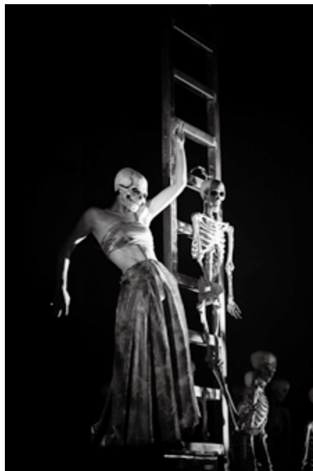
■ The Seventh Day at the 9th Wuzhen Theatre Festival