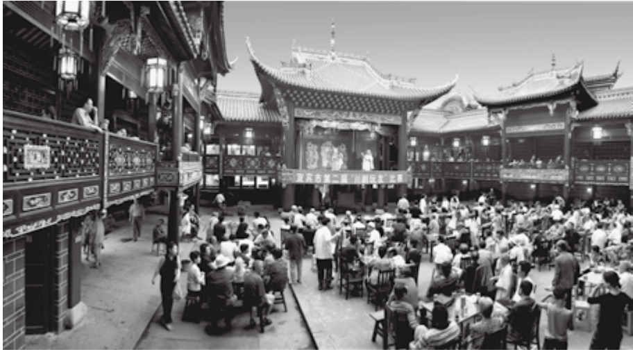
■ Xi Lou at Yunnan Guild Hall in Yibin City, Sichuan