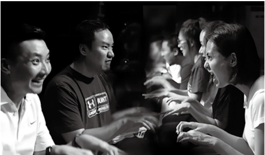
■ The Crowd

The Crowd relates the story of a boy whose mother was beaten to death by laborers during Cultural Revolution. As the boy matures, he searches for the murderer, intent on revenge, only to discover the murderer's son who tells him that his father committed suicide after he left the hospital in 1987. This play involves many cities: the violent setting of Chongqing during Cultural Revolution, whose tragic scene, though rarely shown in plays, is vividly presented by the playwright. The whoring scandal related to a judge from Shanghai is also one of the issues connected through the characters in