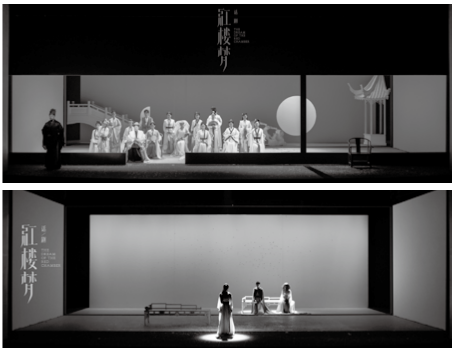
■ The Dream of the Red Chamber