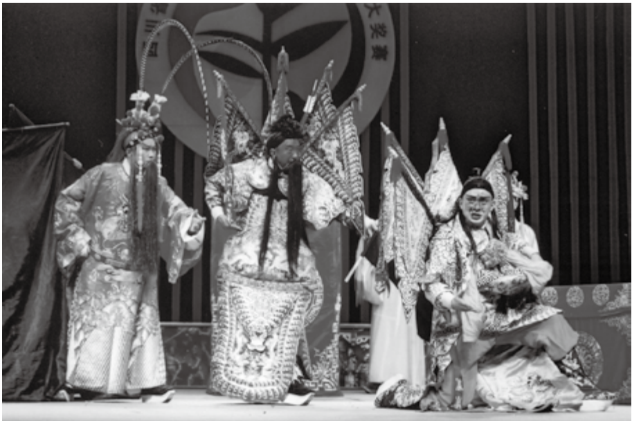
■ "Blowing to change facial make-up" in Mulian Xi Breaking Vegetarian

"Using masks to change facial make-up" is also a common means of artistic expression. The traditional Chuanju Capturing Sanlang Alive relates the story