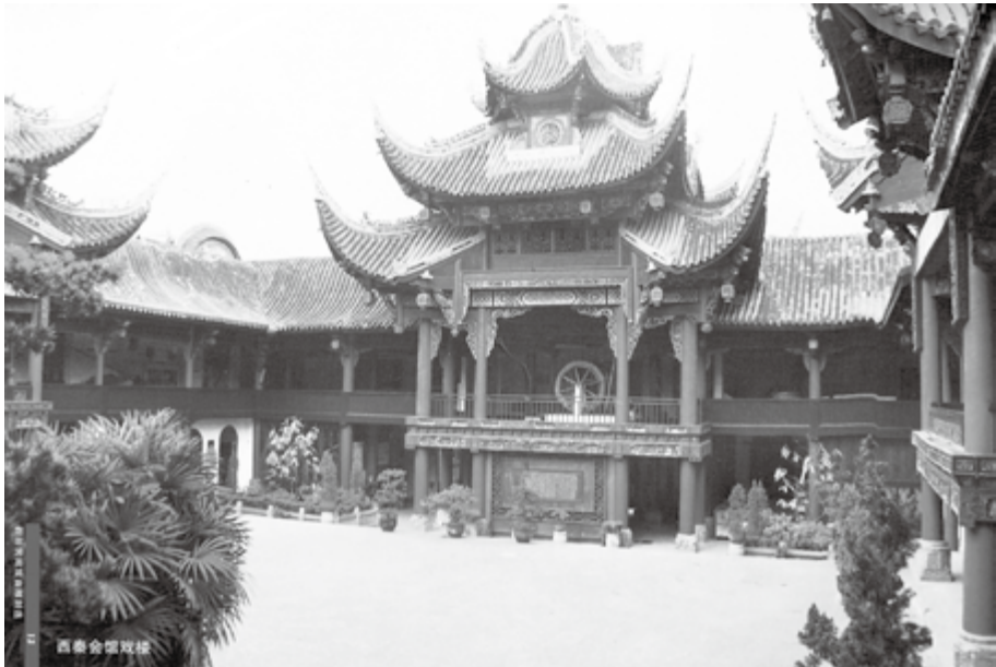
■ Xi Lou at Zigong Shannxi Merchant Guild Hall