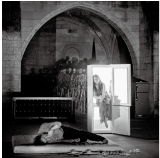
■ The Seventh Day on stage of Avignon