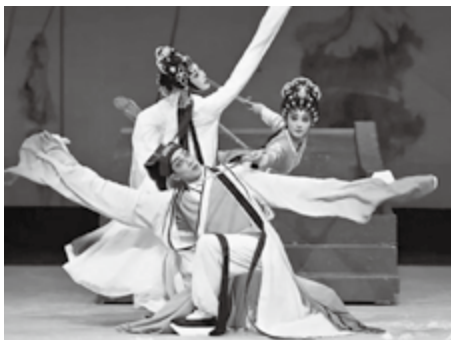
■ Cantonese Yueju White Snake

On the evening of October 28th, the thematic performance Faith - commemorating the 80th anniversary of Shaoxing Yueju reform and the 100th anniversary of Yuan Xuefen's birth - was staged at the Experimental