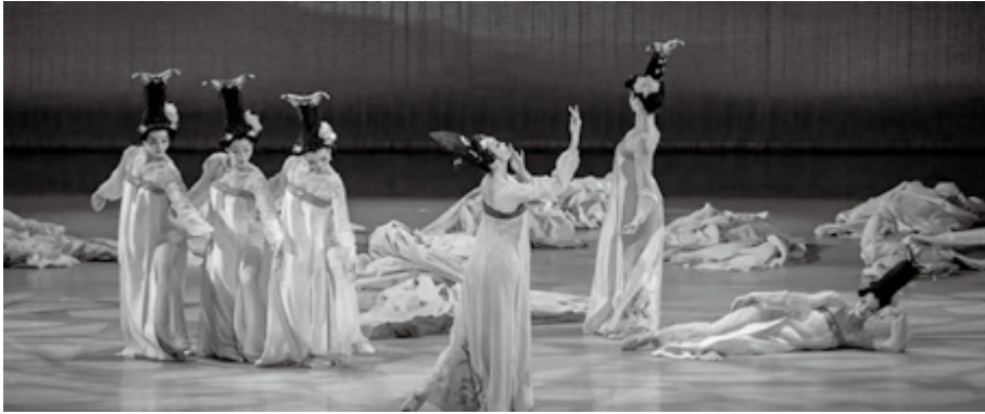
■ Du Fu

Butterfly Lovers , War Soul - Team No. 3 , Water Show , along with the magic show Love at First Sight , took the stage during the festival.