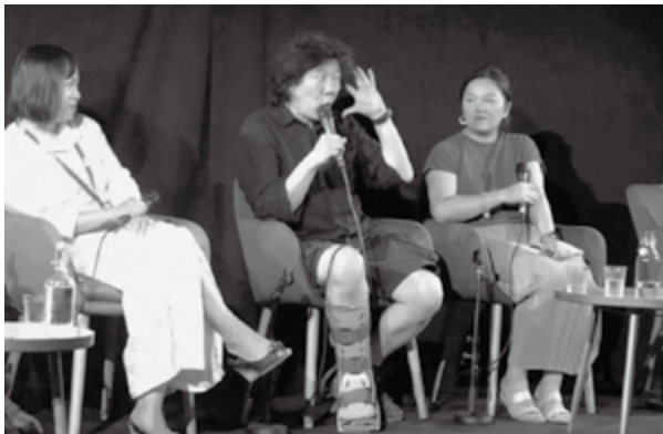
■ Meng Jinghui is being interviewed