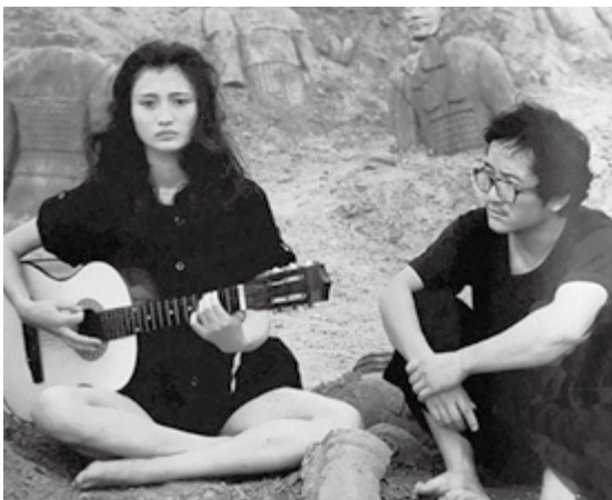
■ Still of the film Questions for the Living (1988)

As for the people's excuses, the ghost chooses to forgive. He didn't regret his own choice and understood everyone's desire for survival. When his friend asked if he hated the people on the bus, he replied, "Hate? Whom do I hate? ... I just felt a little lonely, a little lonely at that time". Finally, before walking into the cinerator, the ghost, with tears in his eyes, says to the living, "O people!