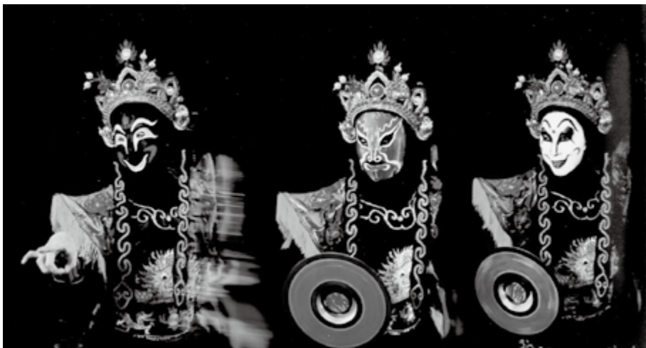
■ Face-changing in Chuanju The Legend of the White Snake

The most successful and influential combination of the face-changing skill and plot is the Chuanju The Legend of the White Snake . The story of the white snake is almost known to all people in China, and can be performed in almost every local theater genre. But the Chuanju version contains its own unique characteristics. For example, the Green Snake in Chuanju can change between