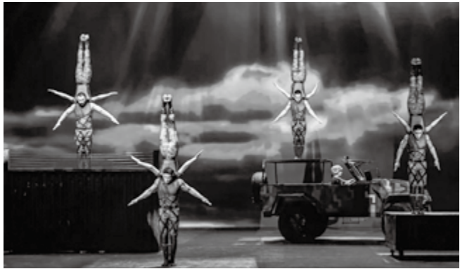
■ War Soul - Team No. 3