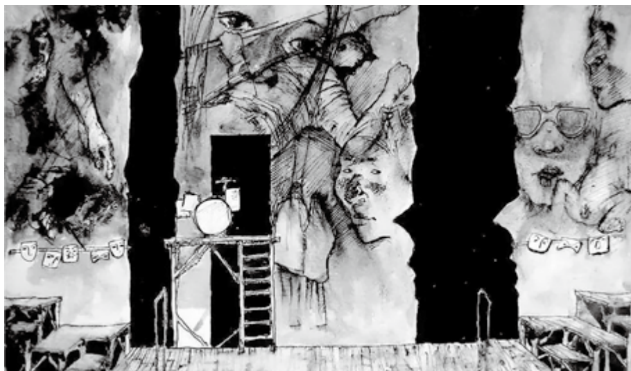
■ Stage set sketch of the 1985 version