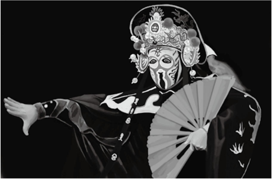
■ Chuanju The Legend of the White Snake Jinshan Temple

the White Snake requires this unique skill, face-changing was mostly mastered by the troupe's Wusheng and Wuchou actors. By contrast, leading roles of the theatre generally did not practice this technique. In the late 1980s, with the popularization of television and the rapid development of media technology, face-changing in Chuanju swept the country due to its elusive nature and strangeness, quickly becoming a hot topic in public opinion.