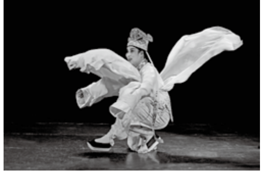
■ Zhezi Skills

style". The fabric used for Xiaosheng's pleats is generally crepe de Chine, which is light and elegant, with high slits for easy performance. Their water sleeves are not the extension of the sleeve of the pleat, but the long sleeves of the "fragrant sweatshirt" worn inside the pleat, which is inspired by the clothing characteristics of Sichuan Paoge Association.