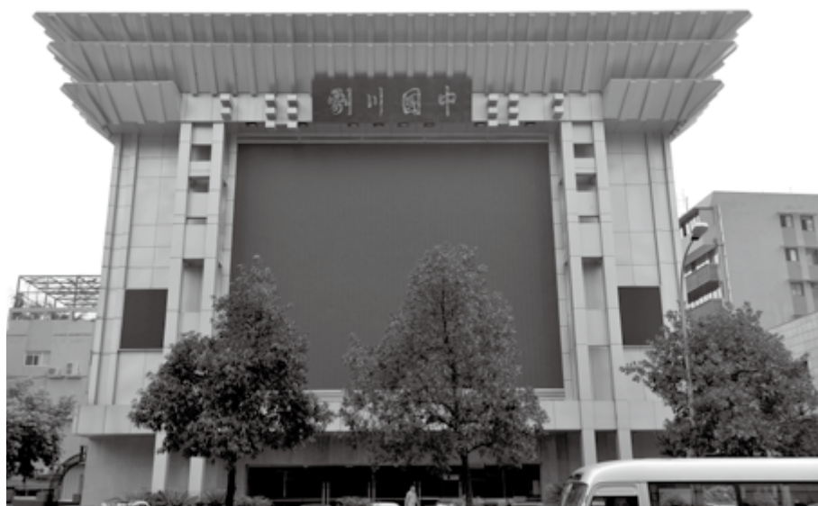
■ Chuanju Troupe of Sichuan Province (also known as Sichuan Opera Troupe)

The Theatre enjoys a good reputation in Southwest China and even the whole country for its artistic dedication to rigorous performances. Since its establishment more than 50 years ago, Chuanju Troupe of Sichuan Province