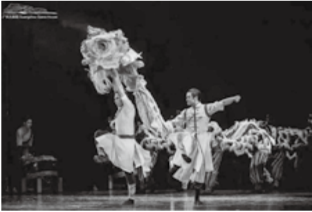
■ Awakening Lion