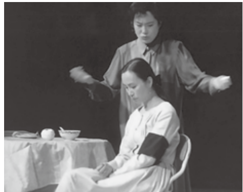
■ Stage photos of Those Left Behind (1991)