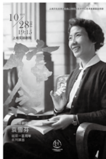
■ Poster of Faith - Commemorative Performance for the 80th Anniversary of Yueju Opera Reform and the 100th Anniversary of Yuan Xuefen's Birth

On December 9th, 10th, and 11th, a special performance titled "Qingfeng