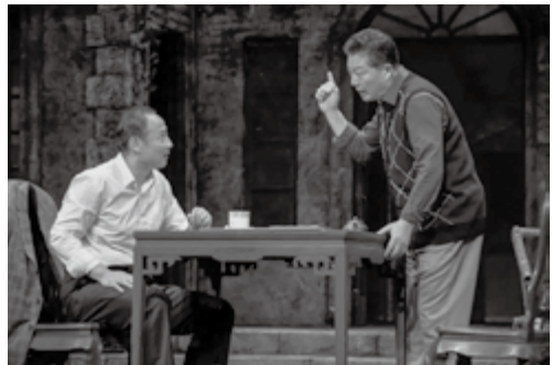
■ House Guest