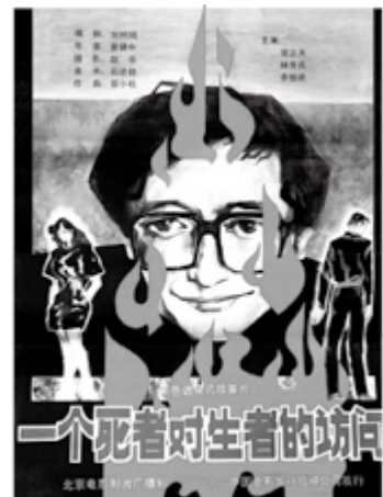
■ Poster of the film Questions for the Living (1988)