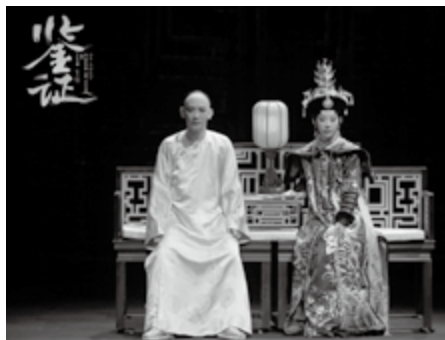
■ Jingju Death of Guangxu Emperor