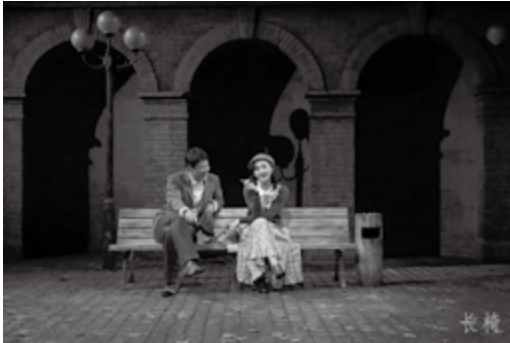
■ The Bench

From September 30th to October 17th, the small theater play The Eternal Flame of Van Gogh , produced by the Beijing People's Art Theatre, returned to the stage of the People's Art Experimental Theatre. This production focuses on several key moments in Van Gogh's life and presents his simple