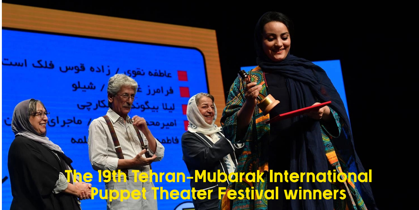
The 19th Tehran-Mubarak International Puppet Theater Festival winners