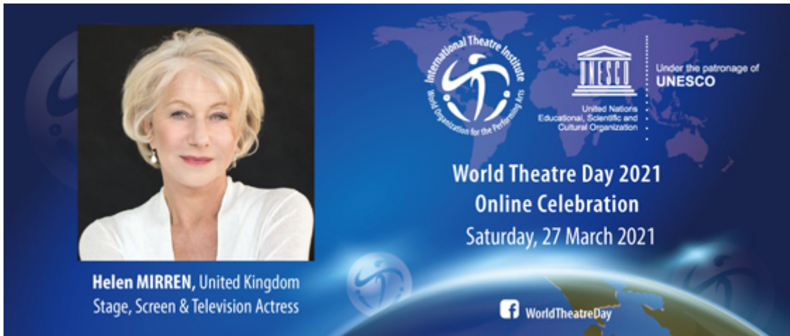
Helen MIRREN, United Kingdom Stage, Screen & Television Actress

Dear Members and Friends of ITI, dear Readers,