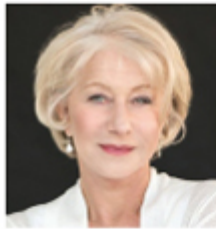
Helen MIRREN, United Kingdom