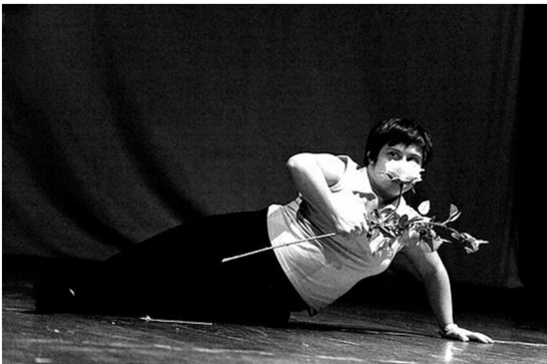
In forma di rosa.

Aenigma University Theater of the Carlo Bo University of Urbino receives the International 3.0 Inclusion Award at the University of Macerata