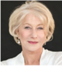
Helen MIRREN, United Kingdom