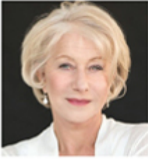
Helen MIRREN, United Kingdom