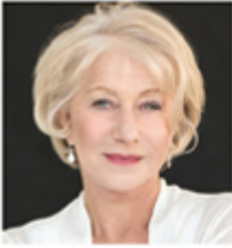
Helen MIRREN, United Kingdom