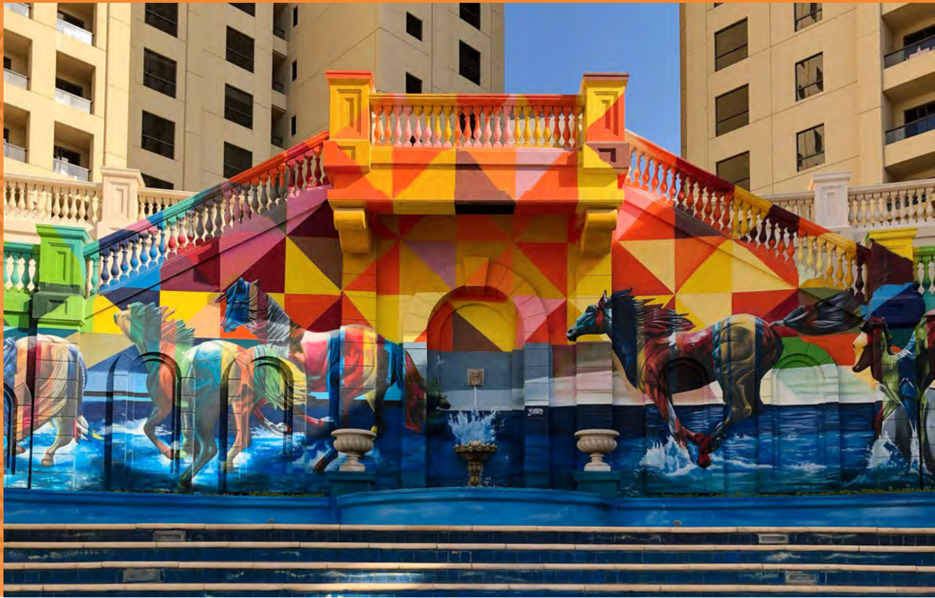
Stairs leading up to a mural of galloping horses at Jumeirah, Dubai

The Arab Organization for Education, Culture and Science (ALECSO), in cooperation with the Qatar National Committee for Education, Culture and Science and Qatar National Library, held a lecture on June 10 on virtual reality to preserve heritage and monuments in the Arab world. The lecture explored other new technologies, such as drones to record and monitor archaeological sites and digital twinning to preserve the originals in digital form, as well as the use of blockchain technology to protect them from looting and piracy. It was noted that these technologies also give new dimensions to people's interaction with exhibitions, creating vibrant and engaging digital displays, and even through artificial intelligence to create smart museums. Participants underlined the importance of regional cooperation to explore new technology to protect Arab heritage, as well as of acquiring skills to address attacks on heritage.