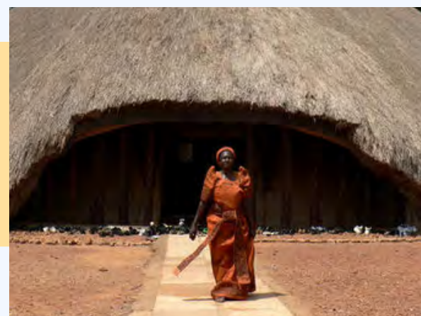
Tombs of Buganda Kings at Kasubi (Uganda)