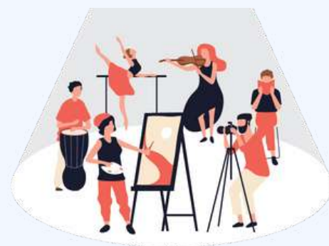
Sustain the Arts (stART) Fund

In Singapore , the National Arts Council and the private sector have jointly launched the Sustain the Arts (stART) Fund , an initiative that provides financial support to small arts organizations to help them sustain their practices in the long term. To date, the fund has raised nearly SGD 4 million ($US3.1 million) from donors and some 20 arts organizations have already received funds in the range of SGD 20,000 to SGD 50,000 ($US15,000 to $US38,000) to fund their programmes.