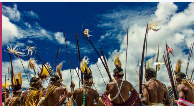
Faris Munandar, Pexels

In Colombia , the Ministry of Culture has ratified the indigenous chapter of the "Ten-Year Plan for Native Languages" , which builds on dialogues with indigenous peoples in the country. The Ten-Year Plan emphasizes the recognition of linguistic diversity and guarantees the protection and revitalization of 65 of the country's 69 indigenous languages.