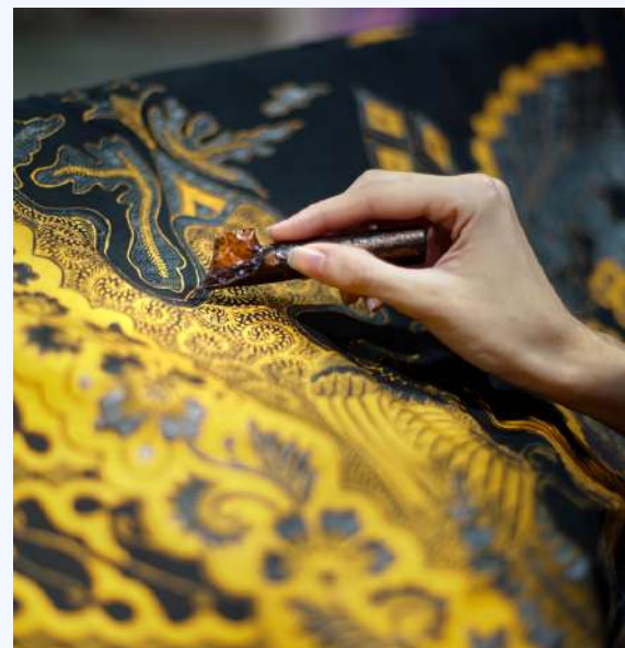
Raditya, Getty Images

This Tracker is produced by UNESCO, in English and French. We are counting on partners to support its production in other UNESCO official languages, to expand the global discussion on culture and public policy.